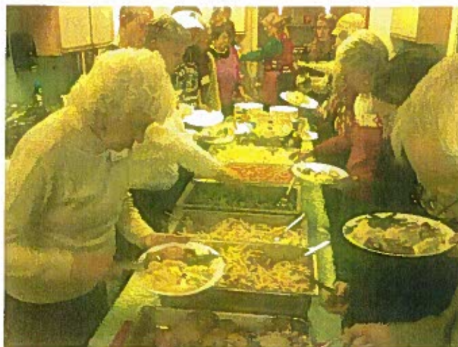
Christmas Dinner on December 19, 2011